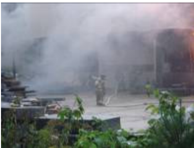
Two minutes prior to BLEVE

Thank you to Amherst, Bedford, Brookline, Lyndeborough, Mont Vernon, and Wilton fire departments, Greater Nashua Salvation Army, Milford Police and Ambulance Service and Milford Area Communications Center for all your efforts.