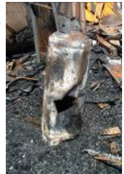
Remains of LPG cylinder found 30' from original locations

Thank you to Amherst, Bedford, Brookline, Lyndeborough, Mont Vernon, and Wilton fire departments, Greater Nashua Salvation Army, Milford Police and Ambulance Service and Milford Area Communications Center for all your efforts.