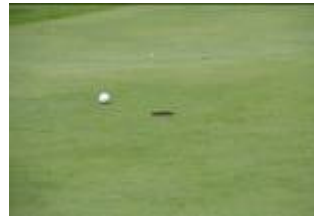
So close but yet so far....