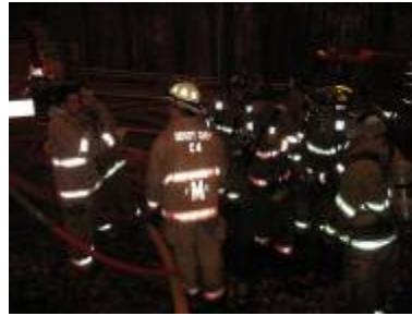
Crews rehab after knock down in Wilton

Well, November certainly brought several opportunities to pay back some debts to our mutual aid neighbors. We even went to New Boston for the first time. As usual, we aided our neighbors' with the utmost professionalism and aggressiveness. Upon returning to from Vermont,