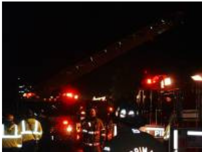
Ladder 1 working at the 3rd alarm in Amherst