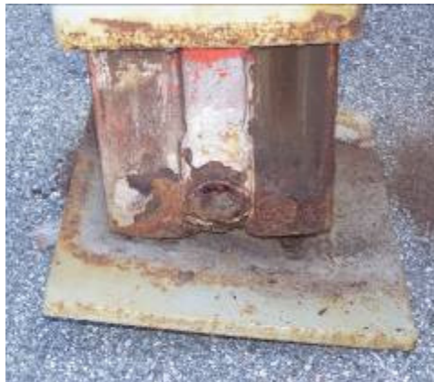
The inner tubes on the outriggers need to be replaced due to corrosion.

The request for proposals (RFP) were received and reviewed. Four vendors bid on the work. However, several unexpected items were identified by some of the vendors which has changed the scope of the work. The actual cost to repair all of the items on the RFP would exceed the allocated funds from the town and most likely the fair trade in value of the truck. The items of most concern is the corrosion on the outriggers, and the rust on the frame and torque box which to repair correctly would require removing all of the compartments. The committee has reviewed the recommended work and supports the recommendation to make only the necessary repairs in the most financially prudent manner and move the replacement of the ladder forward.. The proposals are being reviewed by the chief and town administration for final decision and award of work.